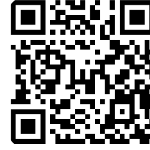
Vulvar Lichen Planus

These handouts are available on our website in many other languages at www.issvd.org/publications/patient-handouts .