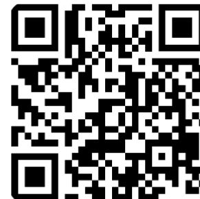
Genital Itch for Women