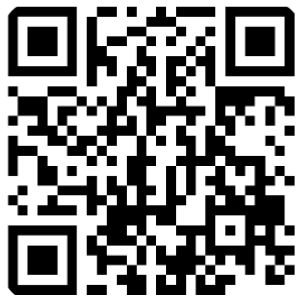
The Pelvis and its Structures