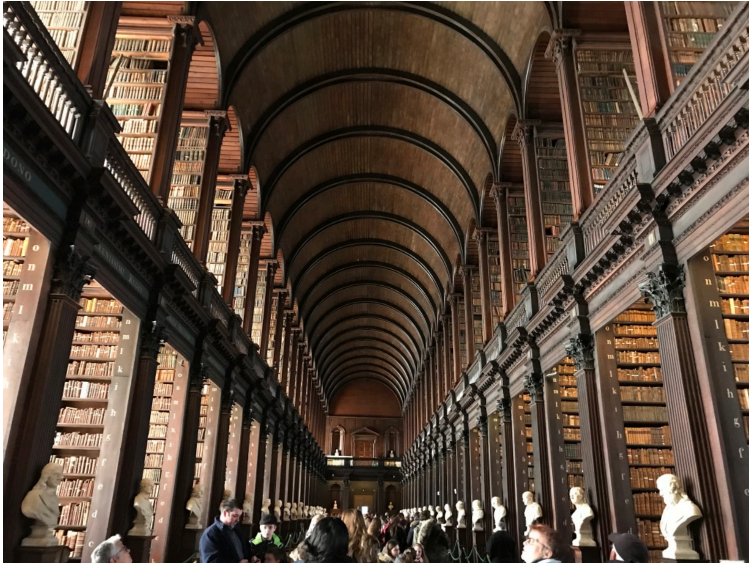
The Trinity College Library is a MUST SEE